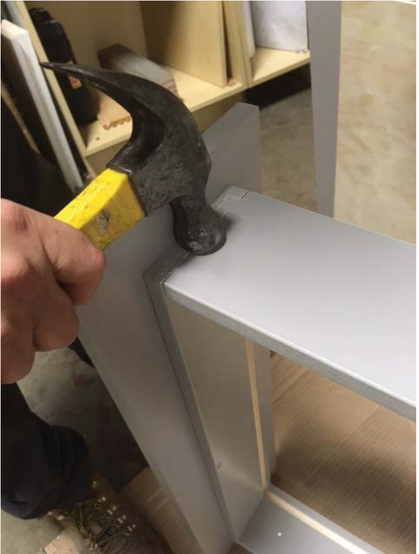
Use hammer to connect the dovetail drawer box.