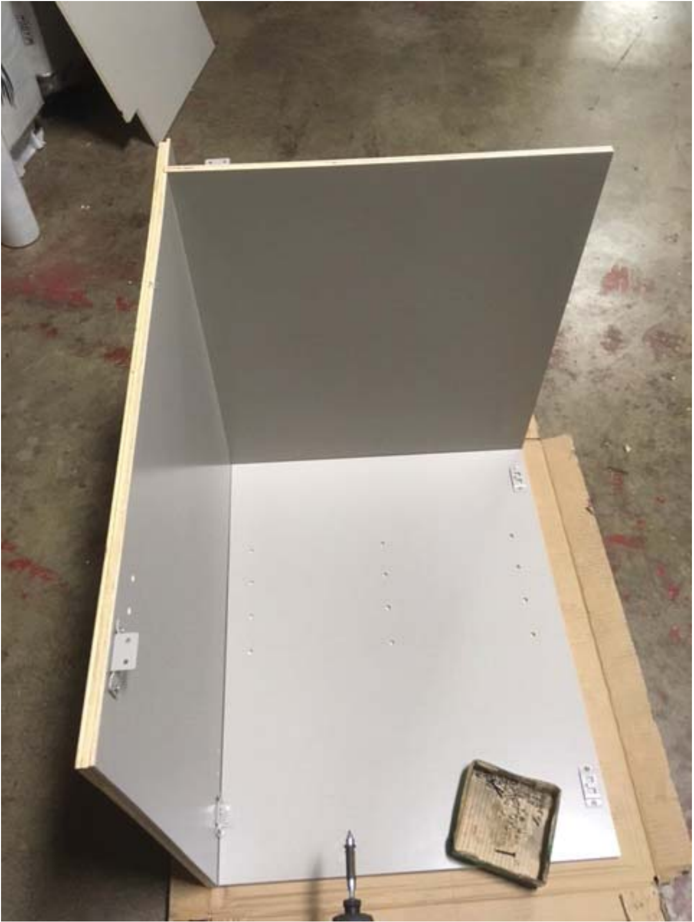
Put the three panels together with L-brackets and slots.