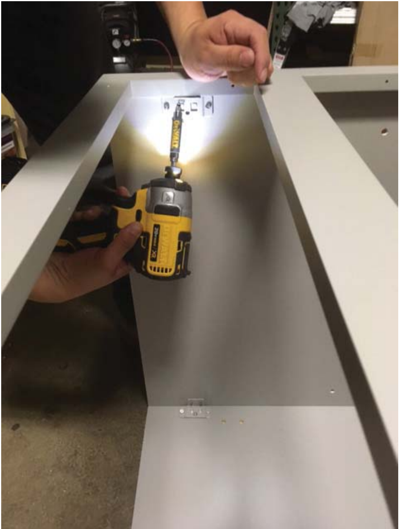
Tighten the frame to the box with L-bracket.