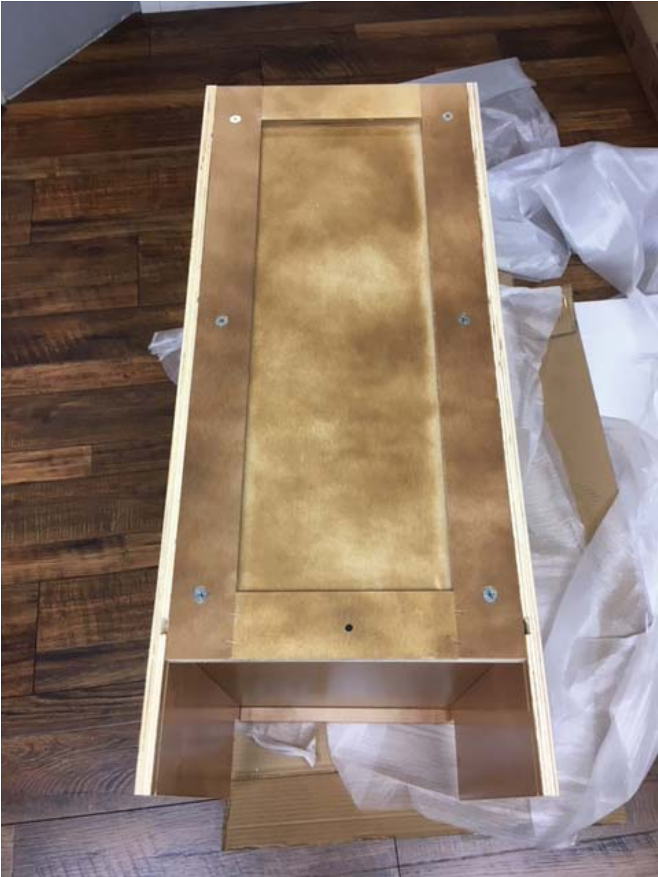
Attach back panel to fit.